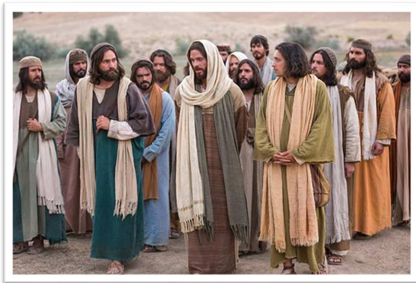
Jesus sends out the 12 apostles