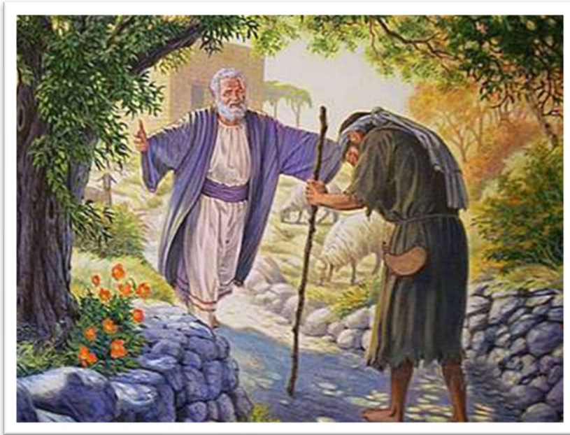
Parable of the Prodigal Son